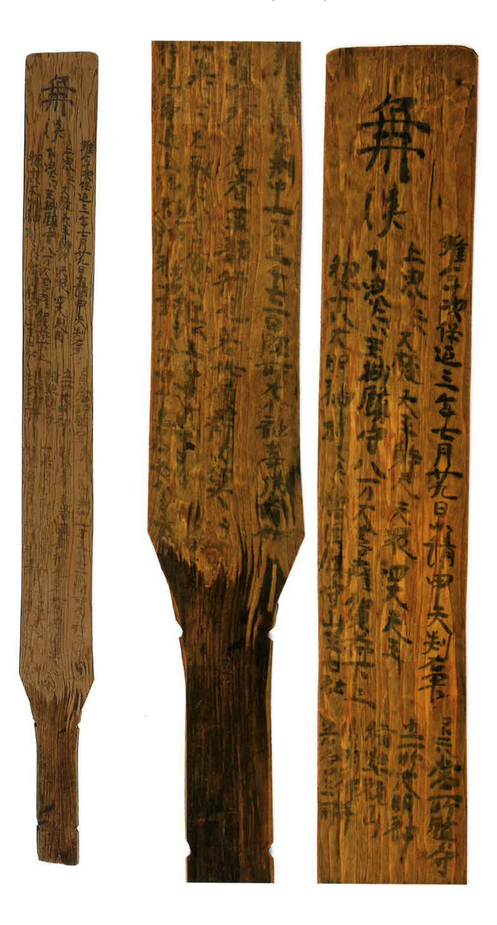
Figure 6: Shioda kishōmon (1137)<sup>17</sup>