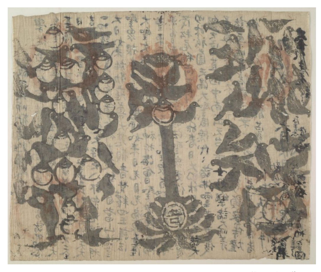
Figure 3: Kosaji kishōmon (1556/Kōji 2) obverse with Kumanosan hōin (熊野山宝印)<sup>13</sup>

Over time, these printed Ox-head talismans became conceived as being an essential element of oaths. This led to some old unadorned documents being retrospectively stamped with an Ox-head seal. For example, in 1302, the commoners of Tōji's Tara estate wrote an oath that has a Kumano Ox-head talisman printed on the obverse (see Figures 4 and 5). The blocks used to print this oath were discovered among the shrine treasures of Sekiganji in Harima province, located near Tara estate. Surprisingly, they had been created in 1538, 236 years after this oath was written. By the first half of the sixteenth century, these seals were thought to be so essential for oaths that some old documents, as seems the case here, were stamped with them centuries after their creation. These seals became so popular that a bewildering variety of them exists today.